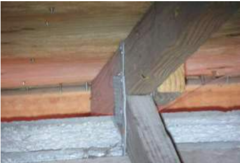
Single wrap with at least 2 nails on the embedded side and at least 1 nail on the wrapped side