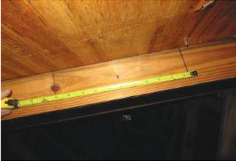
6" spacing in the field