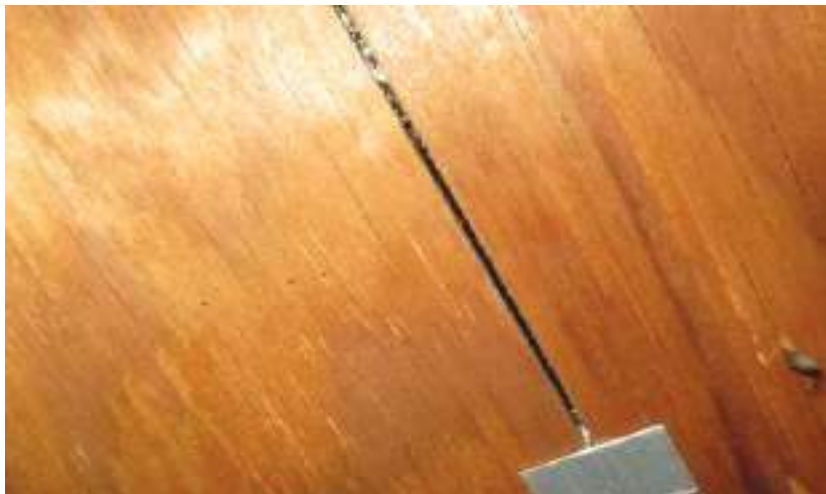
SWR installed under the metal panels