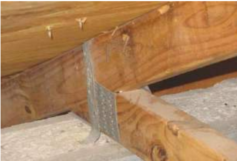
Single wrap with at least 2 nails on the embedded side and at least 1 nail on the wrapped side