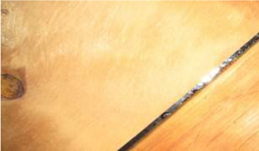
SWR installed under the metal panels