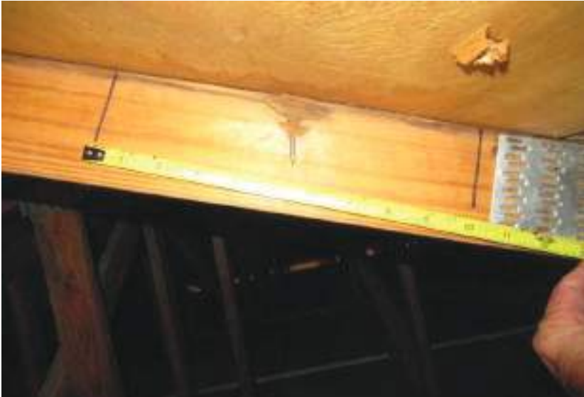
6" spacing in the field