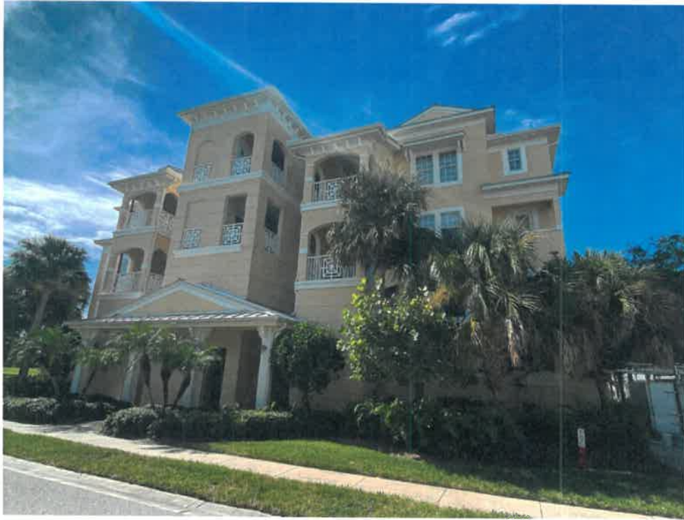
Figure 1: Typical 4-Story Roof Type (Metal) and Geometry (Hip)