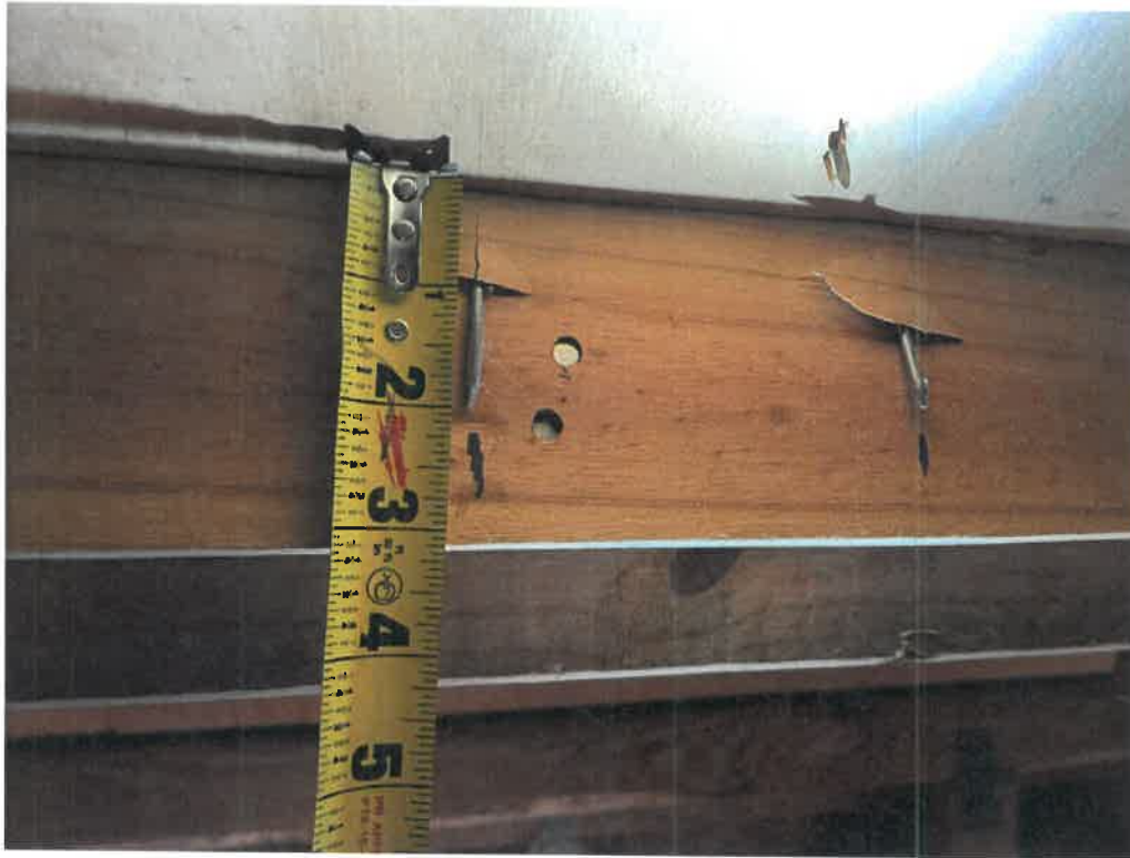
Figure 3 – Sheathing Fastener Size 8d Confirmed (Typical)