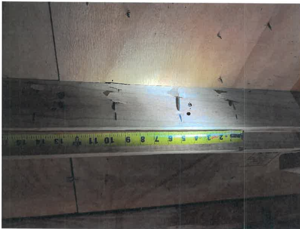
Figure 2 – Plywood Sheathing Nail Spacing (Typical)