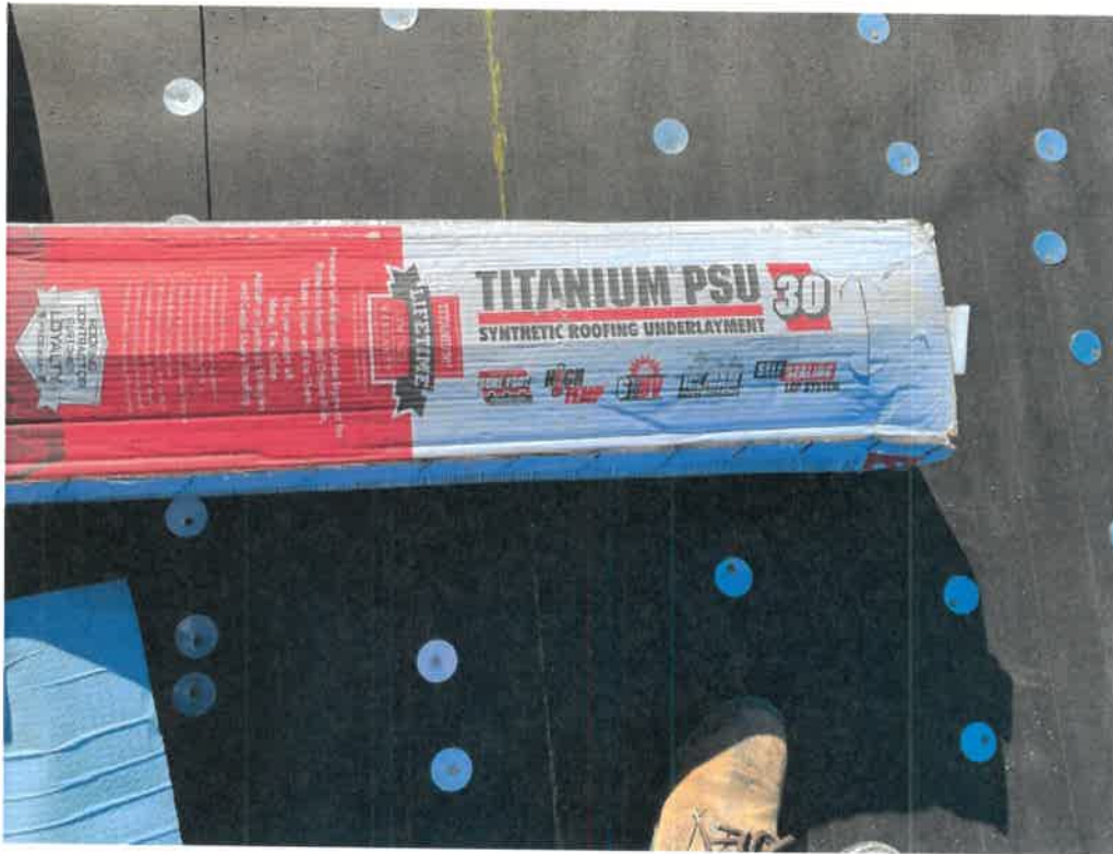
Figure 4 – Secondary Water Barrier at Sloped Section (Typical)