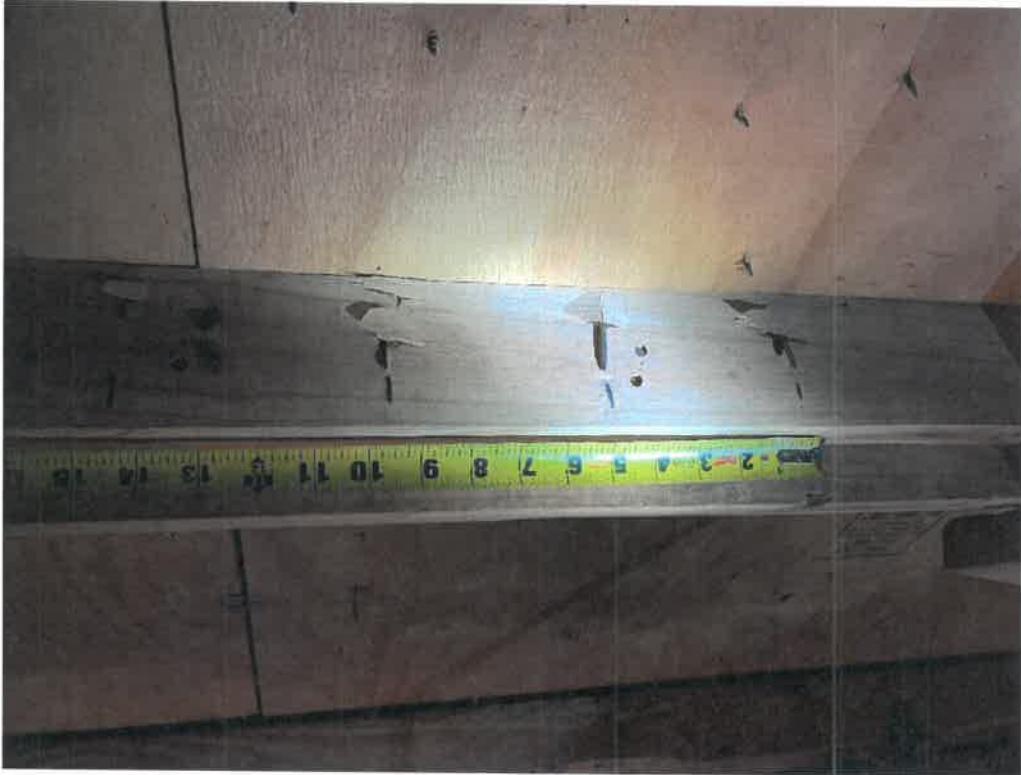
Figure 2 – Plywood Sheathing Nail Spacing (Typical)