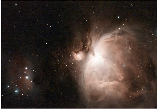
De Marian's Nebula - February 2021.