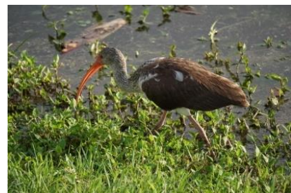
An Ibis searching for a snack – January 2021.