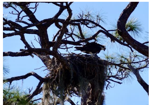
Hammocks Osprey Nesting

Threats to osprey eggs and hatchlings are primarily opportunistic eagles. While socially interactive most of the time, during nesting season all bets are off. If you have witnessed sparring between an eagle and an osprey it is a midair show, that doesn't disappoint. So, the next time you stroll around Lemon Loop, take a minute or two to watch the activity in the nest. Perhaps if you are lucky you may catch a glimpse of a youngster or observe them during feeding time.